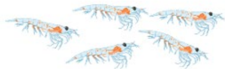
Krill: a key prey item in marine food webs