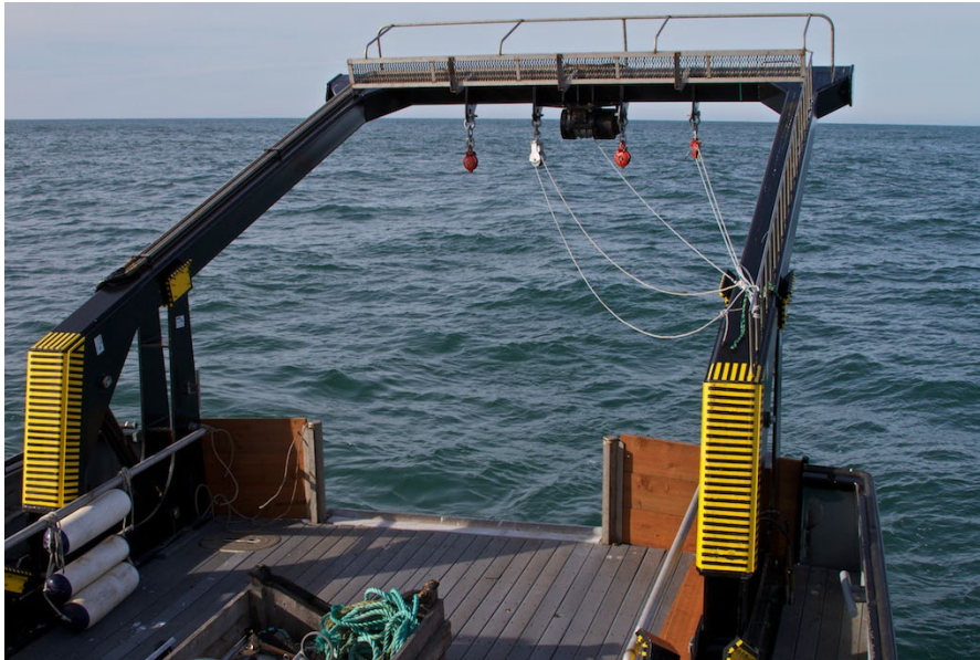
FIGURE 5. A-FRAME OF THE R/V PACIFIC STORM, IN DEPLOYED POSITION.

This custom-designed heavy-duty A-frame is stern mounted with 21 feet of reach. A PullCaptain H-18 winch is located on the A-frame's cross member which can be fitted with various diameter lines. The winch and A-frame regularly handle loads associated with the deployment and recovery of RHIBs and complex moorings.