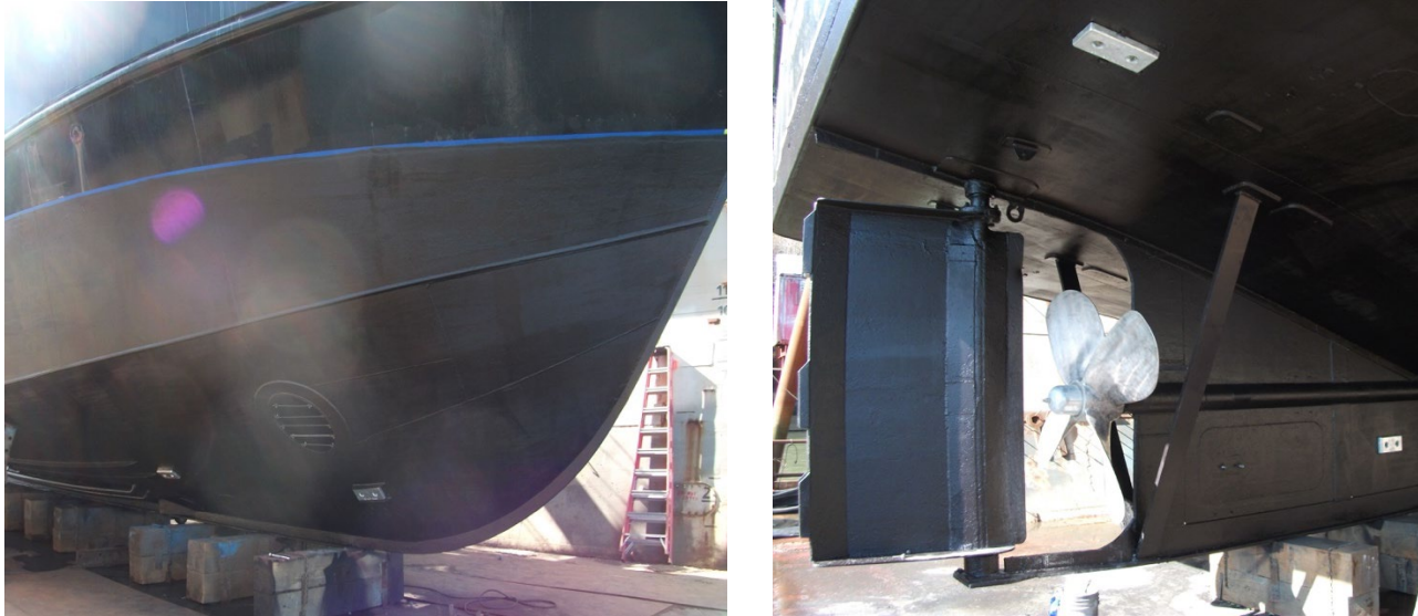
FIGURE 1. R/V PACIFIC STORM HULL, SHOWN FROM THE BOW (LEFT PANEL) AND PROPELLOR AND RUDDER (RIGHT PANEL).