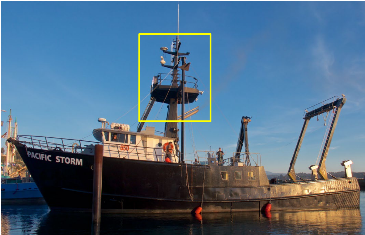
FIGURE 4. R/V PACIFIC STORM, SHOWING THE OBSERVATION PLATFORM (CROW'S NEST) OUTLINED IN YELLOW.

The vessel has a large observation platform located on the mast. The platform can be used for different purposes including marine mammal or bird observations, mounting of user-supplied scientific instrumentation, for photo and video coverage of the weather and aft deck work areas, or unobstructed views of the sky or horizon. The mast standing area is surrounded by restraining rails and is suitable for up to five observers. It is accessed via a sloped stairway with handrails on the back of the wheelhouse and a second sloped stairway with handrails on top of the wheelhouse. The rail on the observation platform is suitable for mounting a laptop enclosure for recording real-time data if necessary.