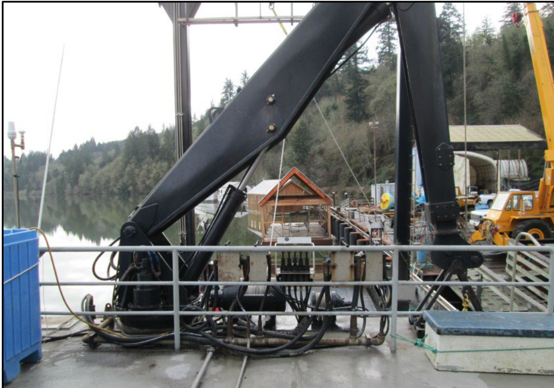
FIGURE 2. R/V PACIFIC STORM CRANE, SHOWN FROM UPPER DECK LOOKING TOWARD THE STERN.

The vessel is equipped with a 5-ton knuckle marine grade crane used primarily to load/unload the vessel at the dock and re-position deck gear. The crane is also capable of launching auxiliary vessels (i.e., rigid-hulled inflatable boats [RHIBs], maximum weight of 4,500-pounds [lbs]) while at sea. The crane hydraulics are powered by a 300-horsepower (hp) Cummins in-line 6-cylinder engine driving three hydraulic pumps. The crane has a safe working load (SWL) of 2,250 lbs at 30 feet and is load tested annually.